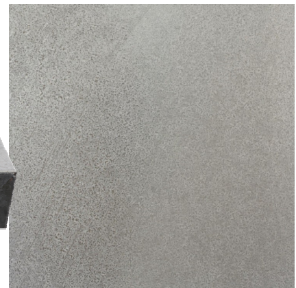
Galvanised Steel Top Lid and Bottom Tray