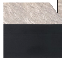
RMF Full depth ABS edging