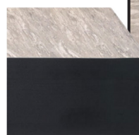
Full depth ABS edging