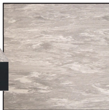
Galvanised steel top and bottom sheet with vinyl covering